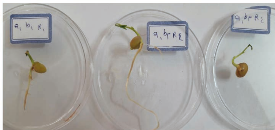
Figure 2: Root and shoot lengths of lentil seedling in \text{TiO}_2 nanoparticles concentrations