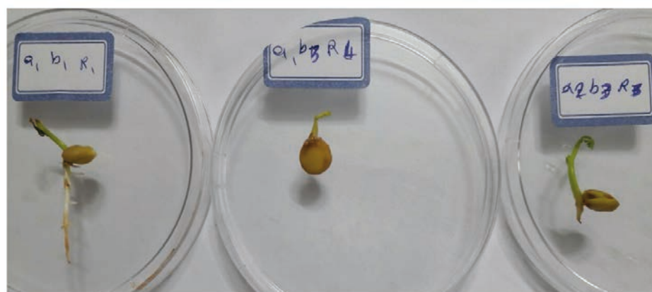
Figure 3: Root and shoot lengths of lentil seedling in \text{TiO}_2 nanoparticles and cadmium concentrations.

The production of active radicals and lipid peroxi-