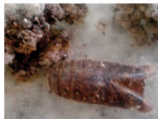
d. Empty pupal case