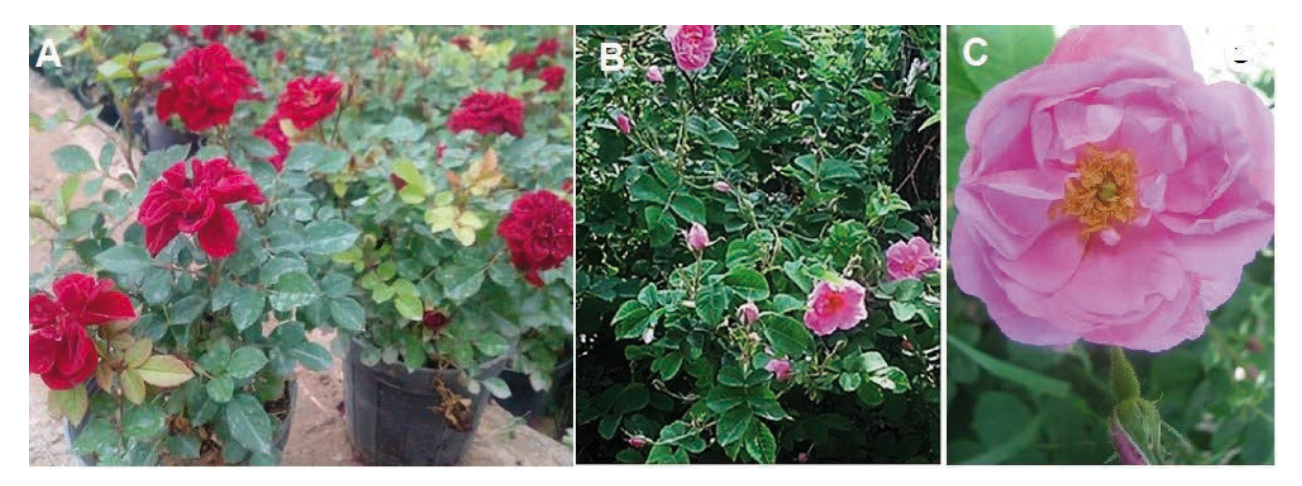
Fig. 1A-C: Rose species. A: miniature rose, B, C: Damask rose