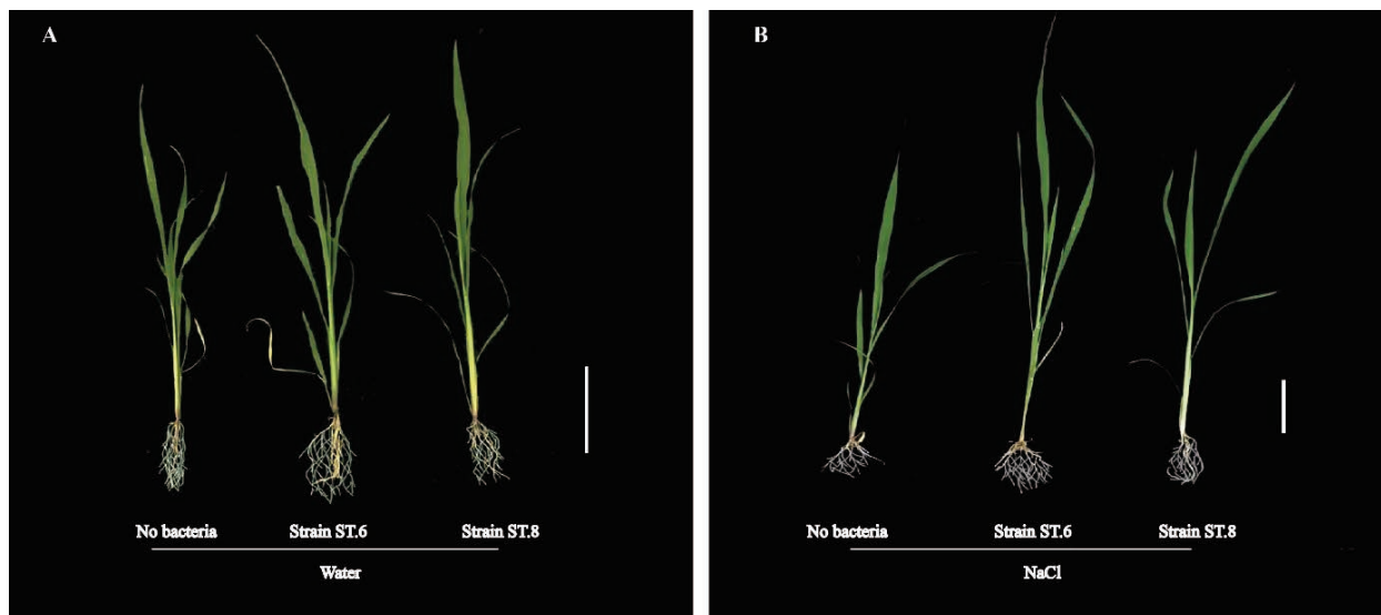
Figure 1. Inoculation of strains ST.6 and ST.8 improves rice growth under normal conditions (A) and in the presence of 150 mmol l -1 NaCl (B). Scale bar: 5 cm